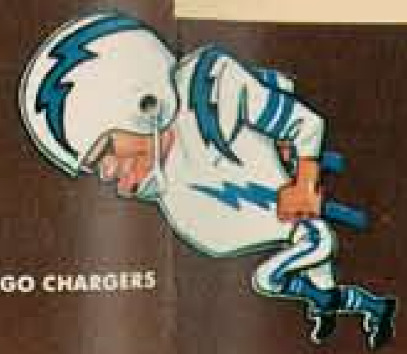
SAN DIEGO CHARGERS