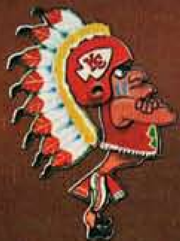
KANSAS CITY CHIEFS