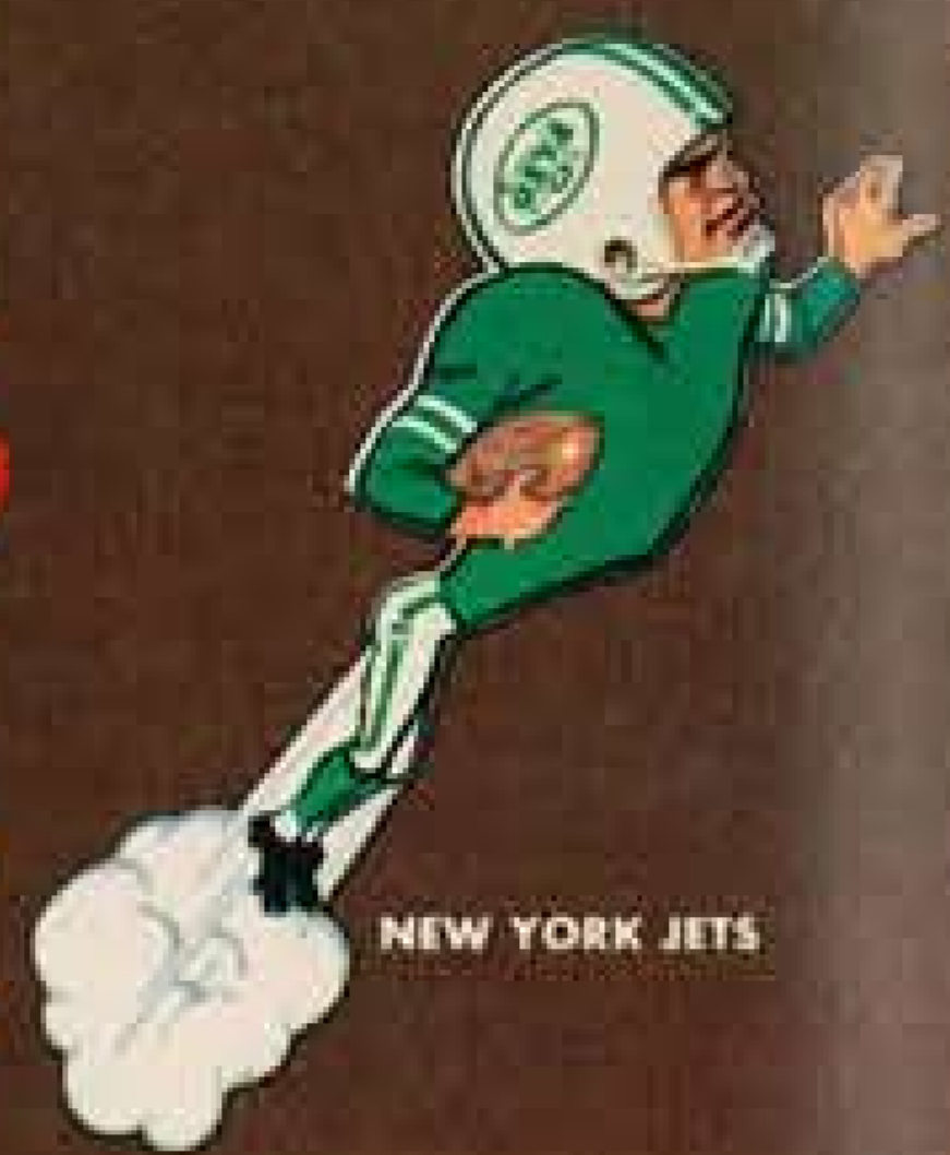
NEW YORK JETS