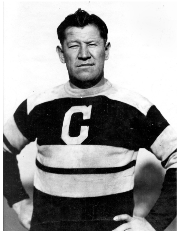
The Legendary Jim Thorpe

While the Bulldogs are no longer around, pro football remembers its early days in Canton, Ohio. Visitors, young and old, enjoy the story of pro football's history in the city where the NFL began!